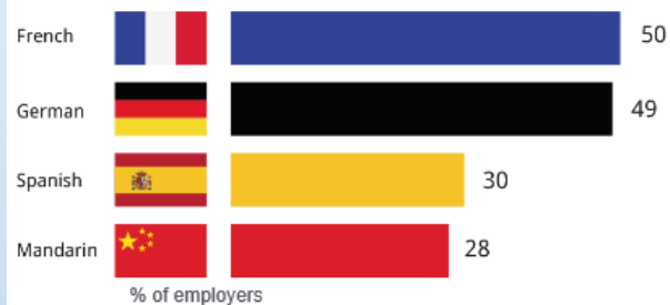
Top 4 foreign languages rated most useful by UK employers

Source: CBI, Education and Skills Survey 2016