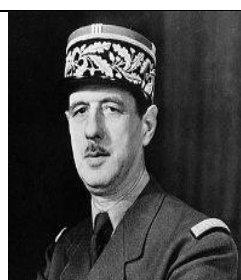
Charles de Gaulle

Pourquoi ces personnes sont-elles connues?