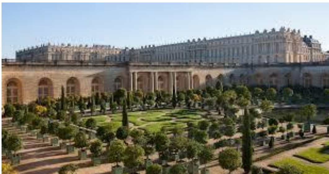
Le Palais de Versailles