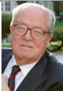
Jean Marie Le Pen